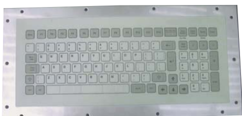
Model No AGE-DAT0-006