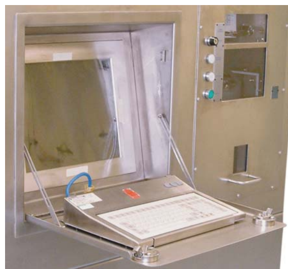
Model No AGE-DAT0-019 (AGE-DAT0-004 ADAPTED TO FOLD AWAY TRAY)