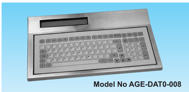
Model No AGE-DAT0-008