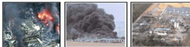
Foundry: cause of ignition, shell moulding machine