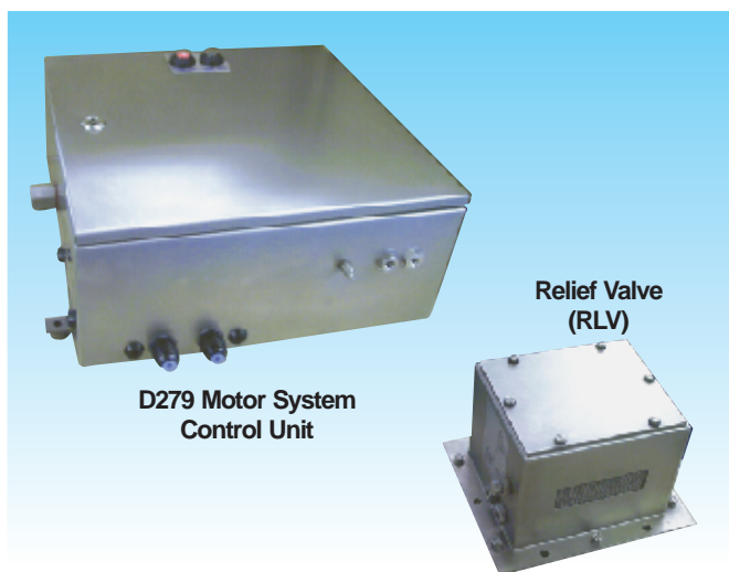
D279 Motor System Control Unit

ATEX Category G D2, Zone 1 (21), Group IIC T6