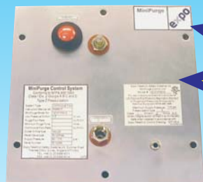
MiniPurge DP panel mount