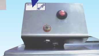
MiniPurge DP back plate