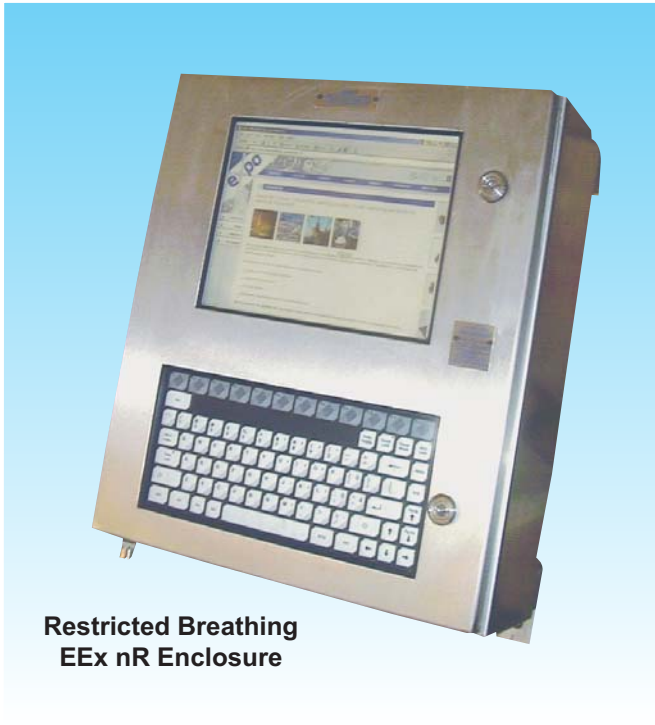
Restricted Breathing EEx nR Enclosure